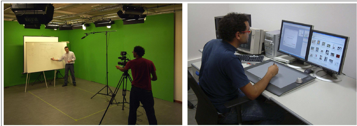
Figure 1: On the left we can observe the record Studio used for the recording of lessons. On the right workstation of the editing room.

Regarding to material resources, these are comprised of the multimedia recording studio and the laboratory room for development of software applications and editing of contents. The workstations of the editing room in the laboratory are fully equipped with the necessary computer material for creating and editing audiovisual content. Figure 1.